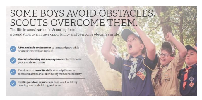
This picture on <a href="https://beascout.scouting.org/">https://beascout.scouting.org/</a> home page. Check it out!!